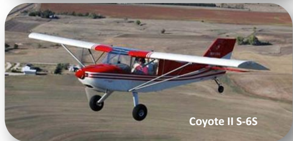
Coyote II S-6S