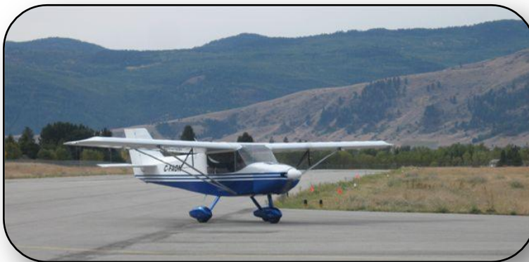
RANS Coyote II