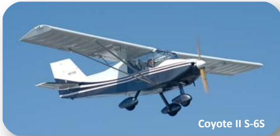
Coyote II S-6S